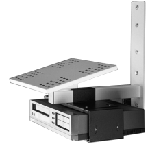
VCR-1418S shown with MMH/D-15